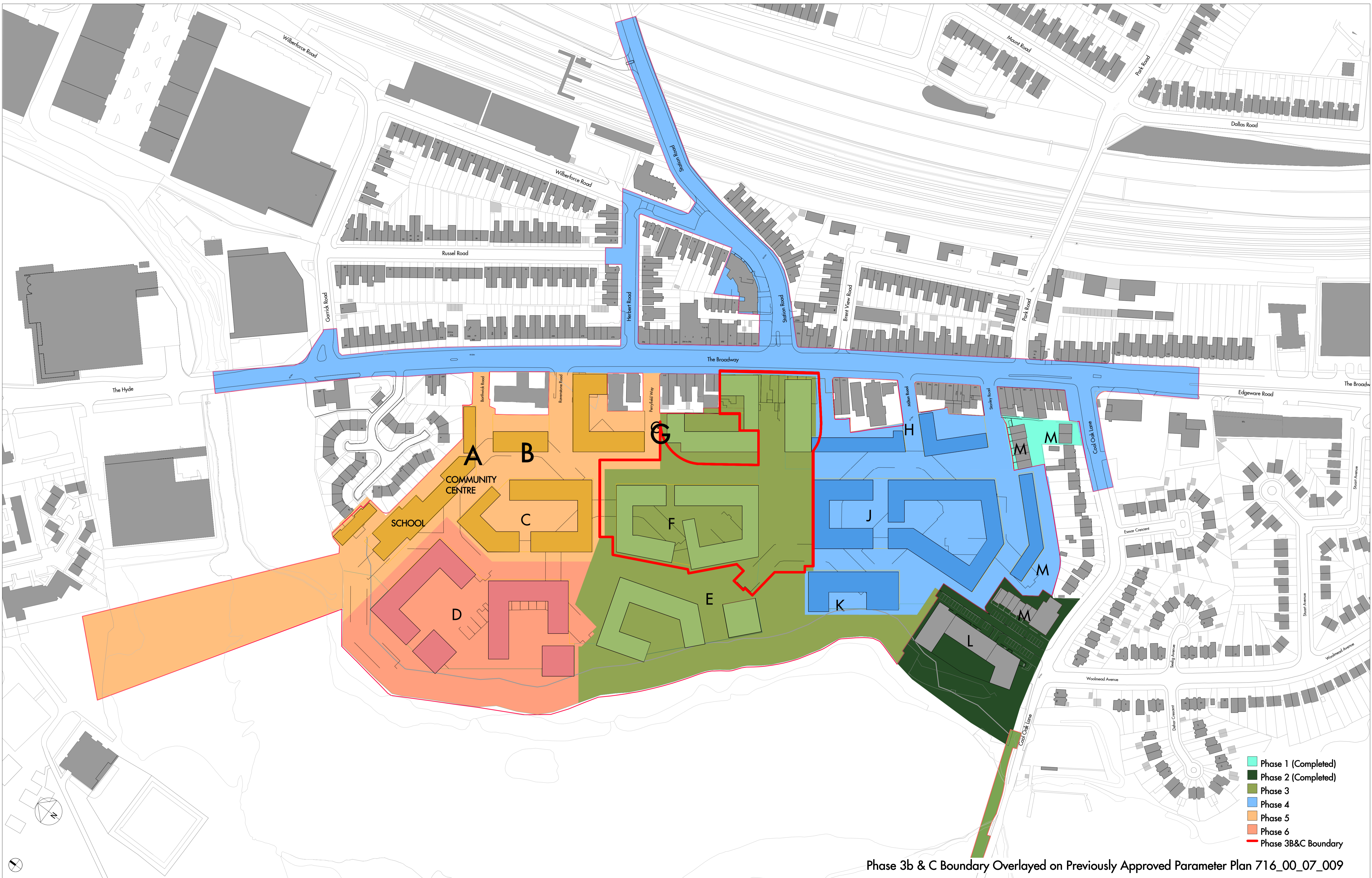
Phase 3b & C Boundary Overlaid on Previously Approved Parameter Plan 716_00_07_009