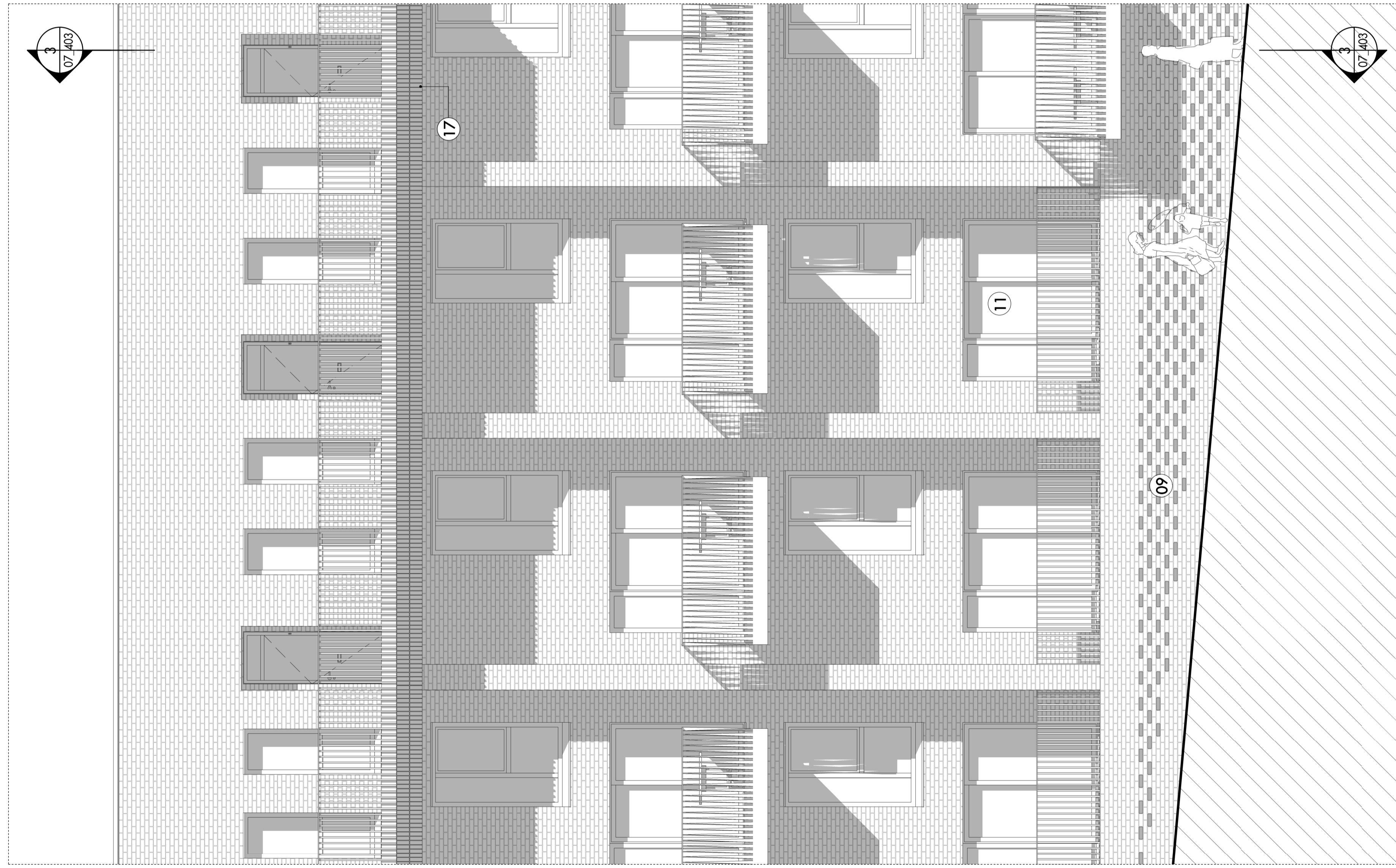
1 Bay Study 4 - Block F3 North West

NOTE: FOR BID AND BAT BOX LOCATIONS REFER TO DRAWING 745_05_07_000