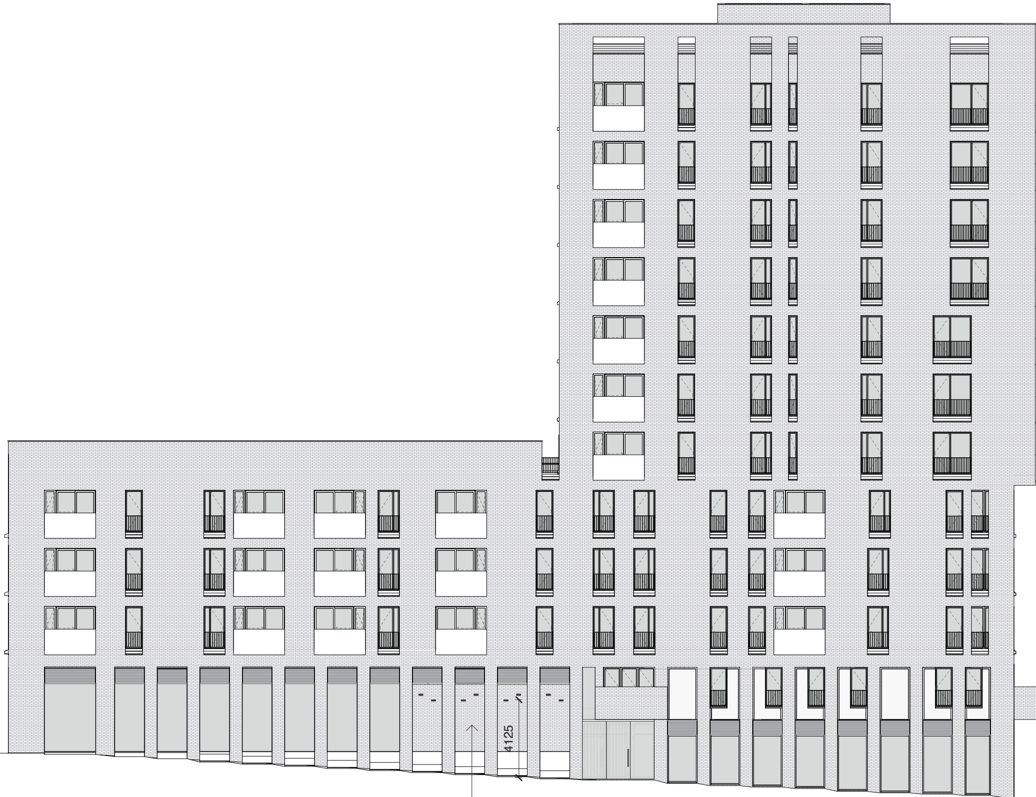
North-West Elevation bat box location